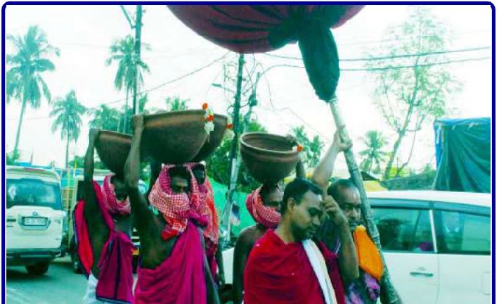
The 'Satapuri Tada' being brought to Shreemindir from Maa AlamaChandi Temple, Atharanala, on the context of Saptapuri Amabasya on Dt. 14.9.23.