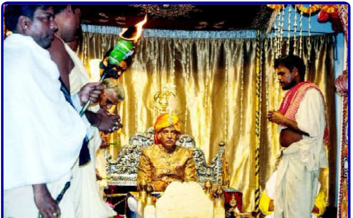
The 'Abhisek' Ritual of the Gajapati Maharaj Shree Shree Dibyasingha Deb held at Shree Nahar on Dt. 26.9.23 in the eve of 'Sunia'.