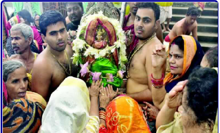
Maa Mahalaxmi's visit to Markandeya Ashram for 'Rusipanchami' Rituals on Dt. 20.9.23.