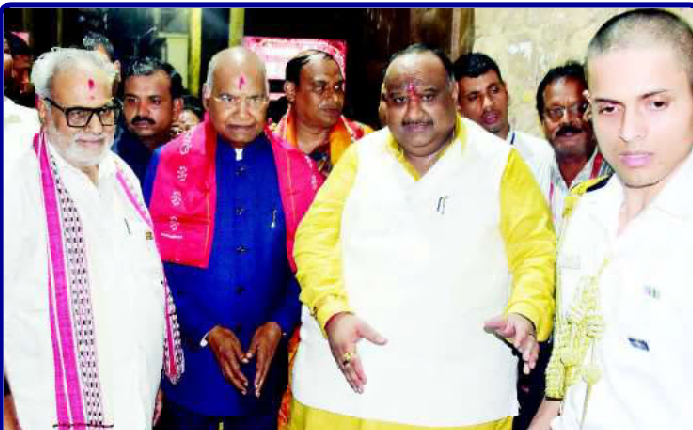
Sj. Ram Nath Kovind, Hon'ble Ex-President of India, had a Darshan of the Lords on Dt. 16.9.23. accompanied by Hon'ble Governor of Odisha Prof. Ganeshi Lal.